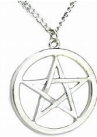
R1003 PENTAGRAM NECKLACE