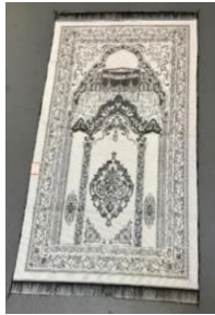
SA-001 MUSLIM PRAYER RUG $16.00