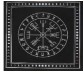
M1002 ALTAR CLOTH 19X20 INCHES