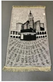
XN-005 INTERFAITH PRAYER RUG $16.00

P.O. BOX 6588 WILMINGTON, DE 19804 OILSFORRELIGIOUSSERVICES-NEWYORK.COM