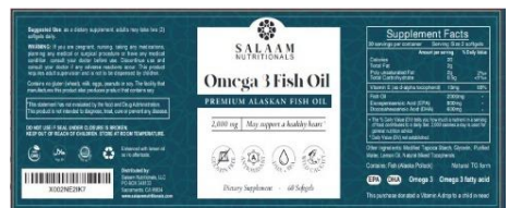
V1003 OMEGA 3 FISH OIL 16.99